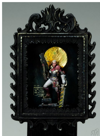
Wren, Noble Bodyguard - Icon #02