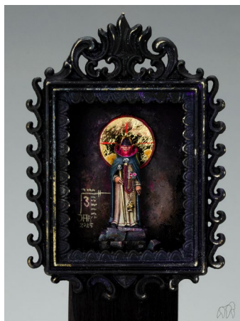
Astropath Varillis- Icon #03